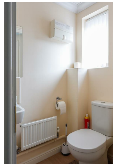
Ffordd Y Mileniwm, Barry